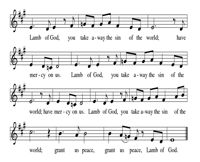
THE ASSEMBLY IS SEATED