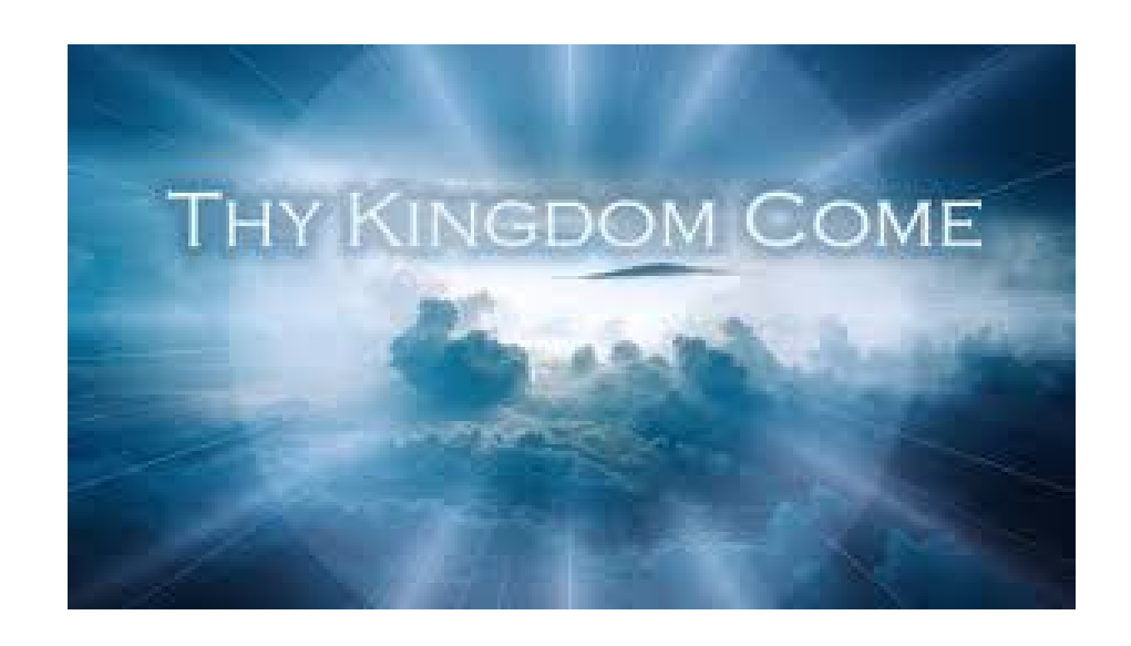
4<sup>th</sup> Sunday of Pentecost June 16, 2024 9:30 AM