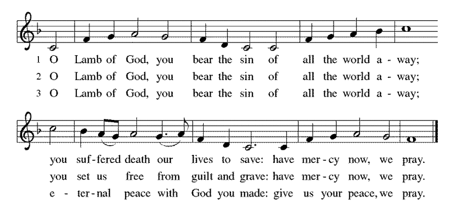
THE ASSEMBLY IS SEATED