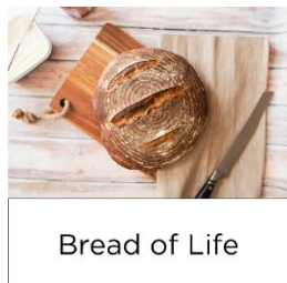
Bread of Life