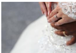
Wedding at Cana