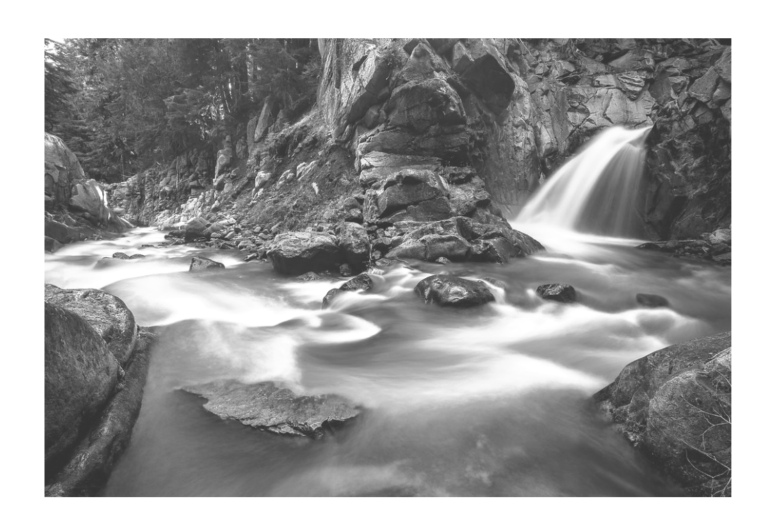
November 14, 2021 25<sup>th</sup> Sunday in Pentecost