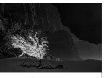
God's Name Is Revealed