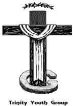
Trinity Youth Group

Saturday, March 21st at 10:00 AM through 2:00 PM