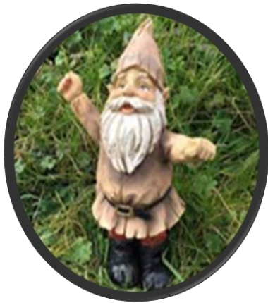
Your financial gnome, Don Icken

Day Light Savings is November 3 rd so remember to set your clocks back one hour.