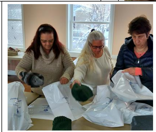
Photos from packing for Seafarers Christmas Satchels December 2017