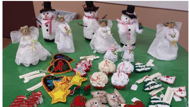
A few of the lovely handmade items by the women of WELCA that will be on sale at the Holiday Market.