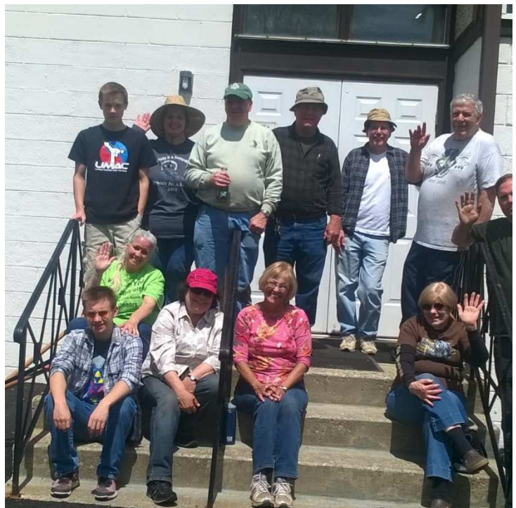
Spring Clean-Up Crew April 2016