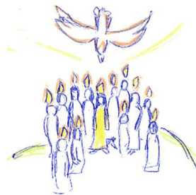
The YOUTH GROUP did a fantastic job leading worship on Pentecost Sunday, May 15!