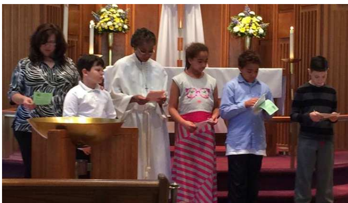
Recipients of the God & Family Awards on April 19th

WELCA Bible Study each first Thursday of the month at 10:00 am in Fellowship Hall; led by various people.