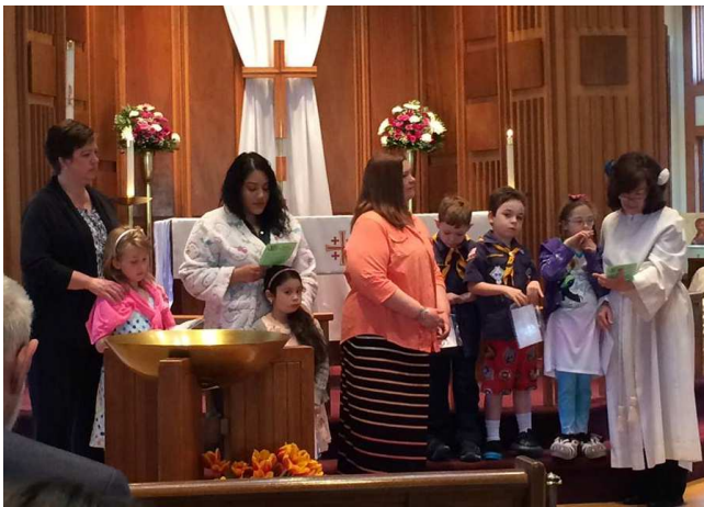
Recipients of the God & Me Awards on April 12th